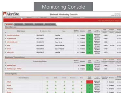
The Monitoring Console display provides a continuously updated view of measurements performed for all monitored servers, sites, transactions and devices.

AlertSite performance advisors provide the industry's most responsive customer service, making sure that your systems and infrastructure are operating optimally and securely. These highly trained technical experts are always available live from 8:00 a.m. to 6:00 p.m. ET, Monday through Friday. We also offer on-call support through 9:30 p.m. ET during the week.